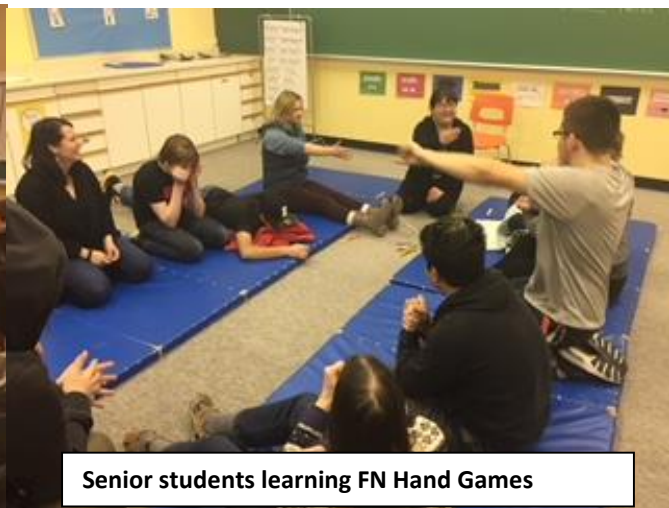
Senior students learning FN Hand Games