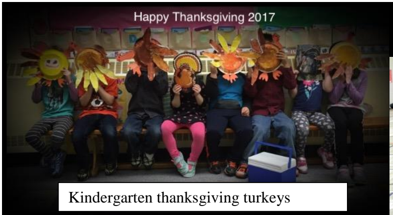
Kindergarten thanksgiving turkeys