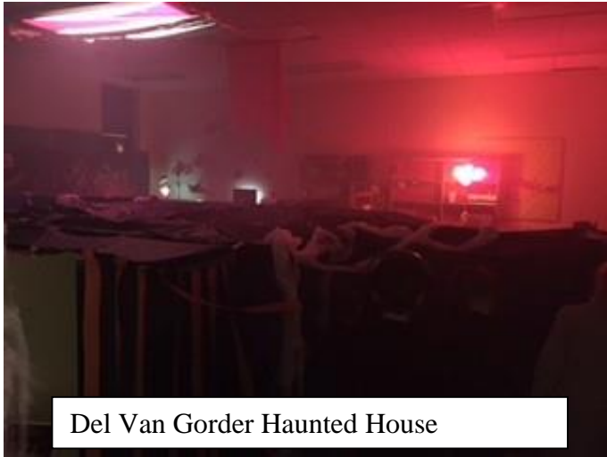
Del Van Gorder Haunted House