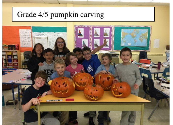
Grade 4/5 pumpkin carving