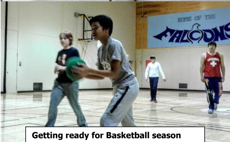
Getting ready for Basketball season