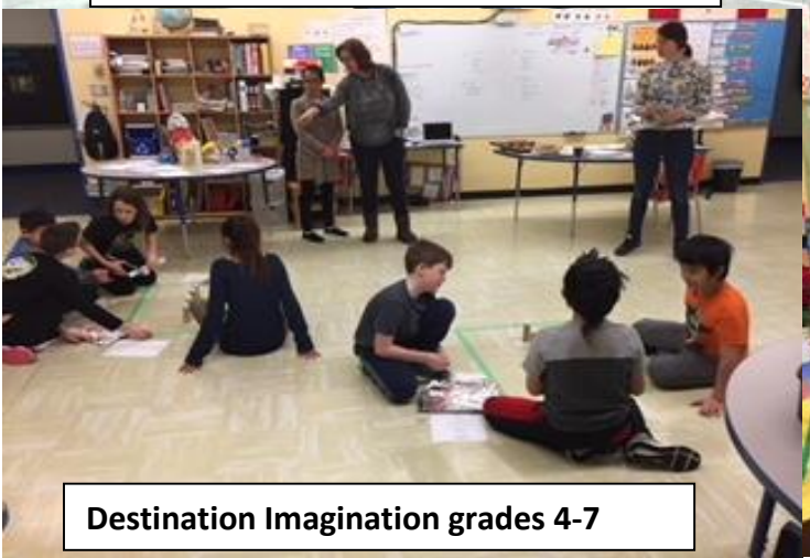
Destination Imagination grades 4-7