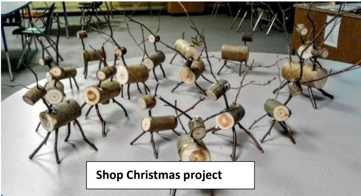
Shop Christmas project