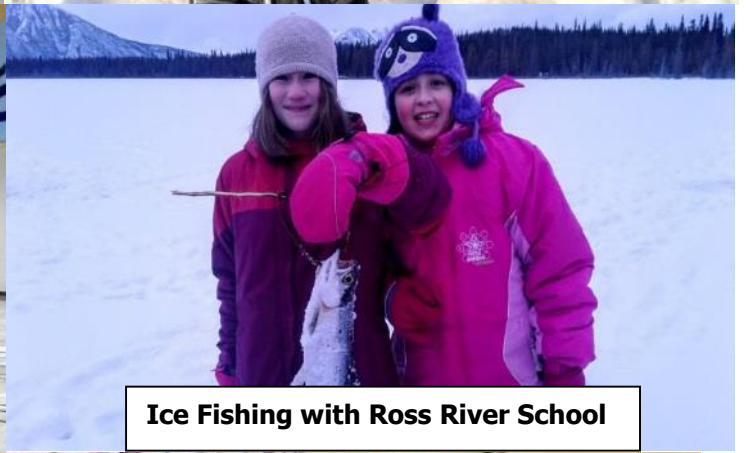
Ice Fishing with Ross River School