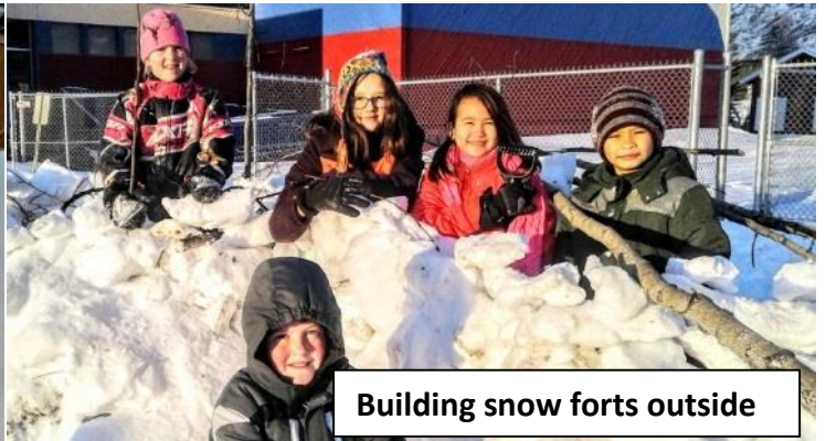
Building snow forts outside